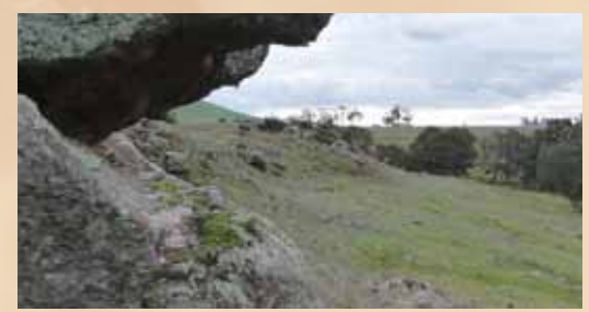
Tullaroop Creek, near Carisbrook, Ben Wurm, private collection, 2010

Under its policy, the ILC agreed to fund the purchase of culturally-significant land at Mount Barker, contribute funding to acquisition of a works depot for Dja Dja Wurrung Enterprises and to provide land management assistance for activities on land owned by the Dja Dja Wurrung People.