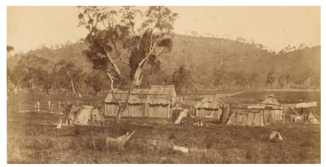
Pictures Collection, State Library of Victoria, accession no H84.167/25, "Aboriginals' farm near Mount Franklin", Fauchery-Daintree collection, ca 1858.